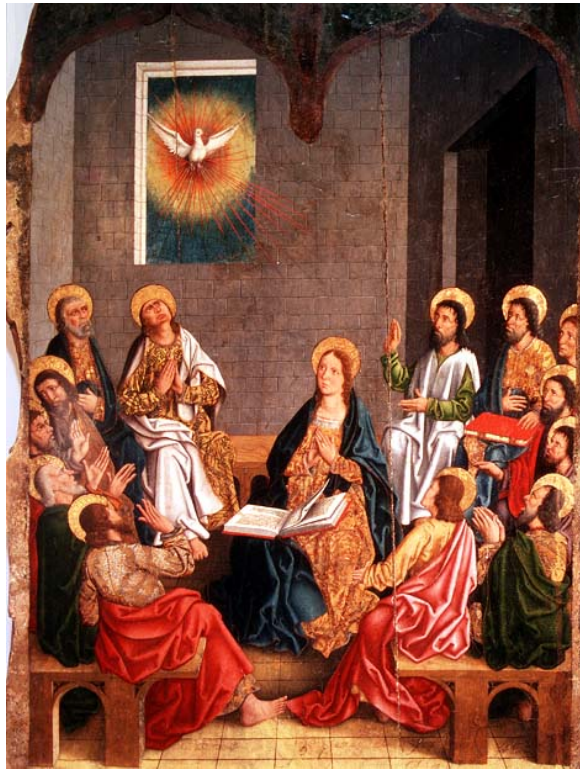
The Pentecost Fernando Gallego