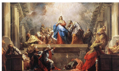
Jean II Restout : Pentecôte 1732

Sometimes the Holy Spirit is called the “Paraclete.” People often misunderstand and think that the word is ‘parakeet’ [like a bird]. Paraclete means, “advocate,” “consoler,” or “helper.”